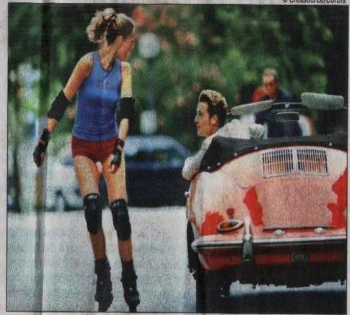
WATCH WHERE YOU ARE GOING

Scientists have developed a new technique that will help you enjoy a quieter drive as it minimizes sudden road noises heard within your car's cabin if you hit potholes or other roadway obstacles. Researchers from the University of Cincinnati have developed an adaptive, active algorithm that would enable the deployment of a rapid-response sound wave that would counter and, in effect, significantly "erase" the perceived road noise heard within the car's cabin when the auto unexpectedly hits a roadway obstacle like a pothole or speed bump. PTI