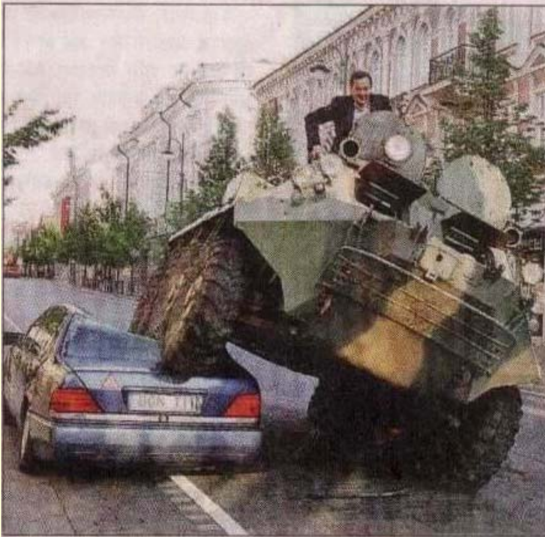
MAYOR ON RAMPAGE: Mayor of Vilnius, capital of Lithuania, drives over a car parked illegally in the city. He took the drastic action as the menace of illegal parking continues despite warnings

The Mayor of Vilnius as a decision maker, destroying the car parked illegally.