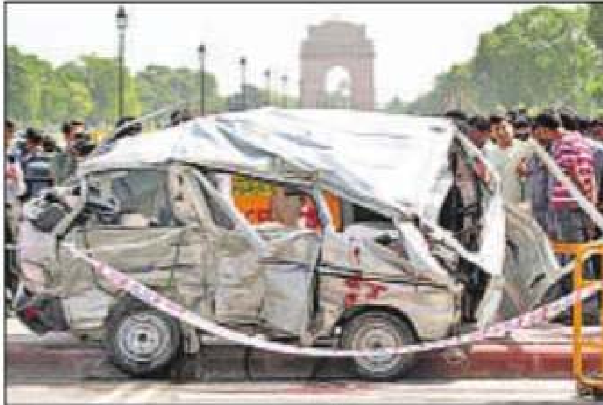
The mangled remains of the Maruti van in which the air force personnel were travelling on Sunday.